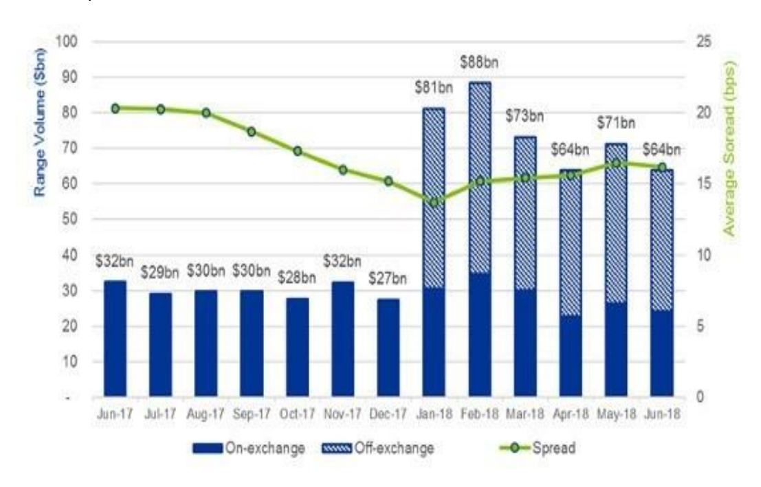
Estimates by Blackrock44

otherwise attractive investment tools for investors. While liquidity is a major point for third country investors, most of the liquidity in EU ETFs is seemingly currently in the dark. A Tape of Record would be a good way of healing this short-coming, once off-venue data quality has been improved.